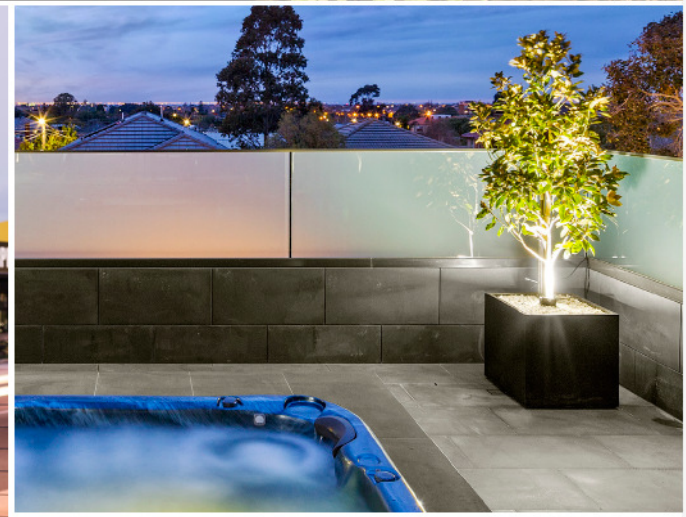
Top: BGC Plaza Above: Caulfield Residence (Designed by AB Studio) Left: Commercial landscaping application