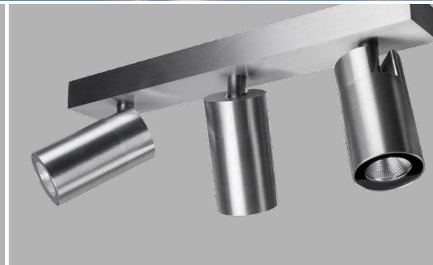
Top: Residential application Left: Each head can be tilted up to 90° Above: Independently adjustable heads